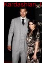
Kardashian, Humphries to wed in evening ceremony